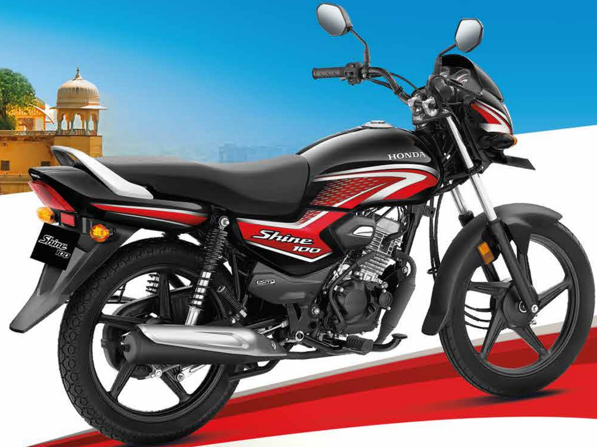
The symbol of never-ending trust, quality, and reliability.